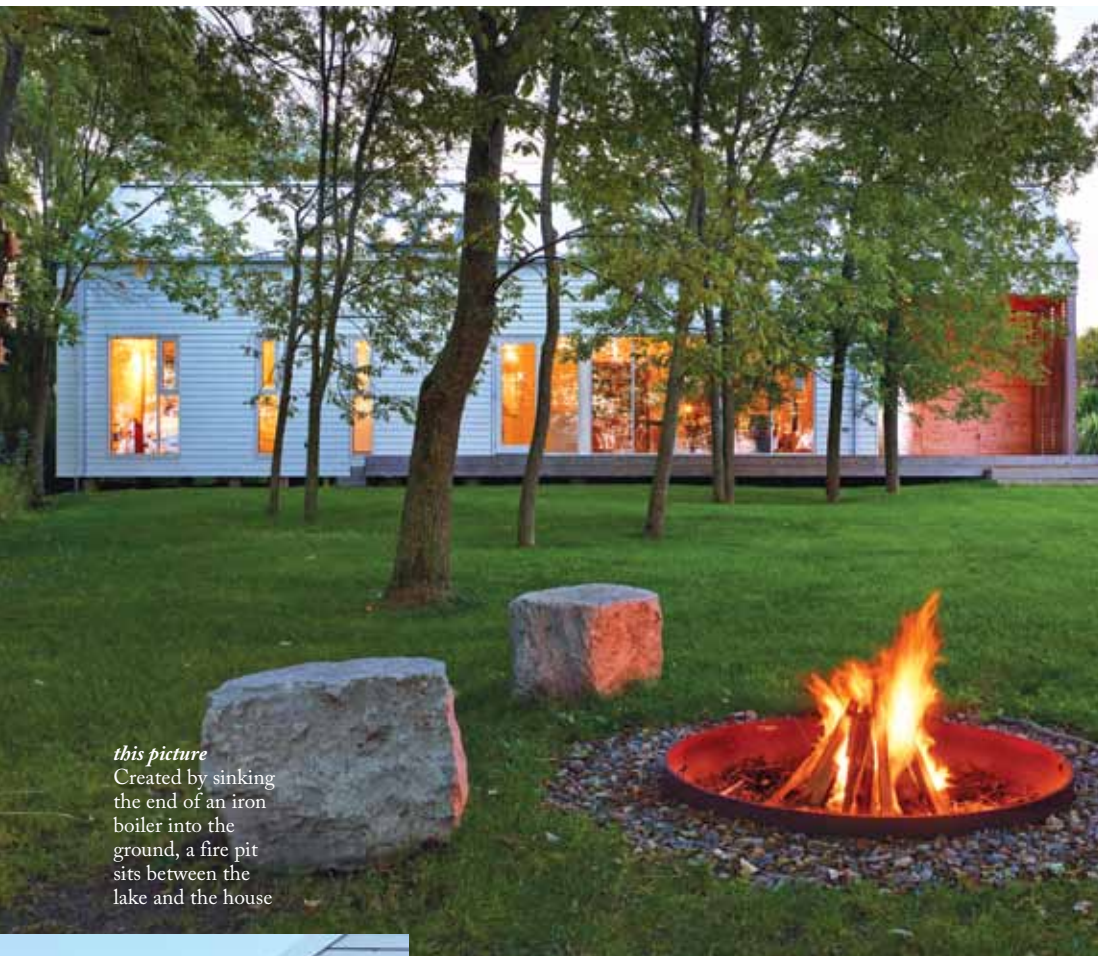
this picture Created by sinking the end of an iron boiler into the ground, a fire pit sits between the lake and the house