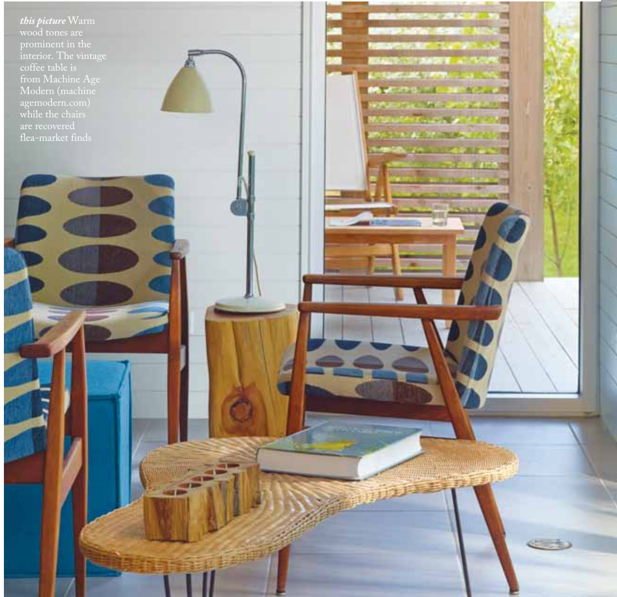
this picture Warm wood tones are prominent in the interior. The vintage coffee table is from Machine Age Modern (machineagemodern.com) while the chairs are recovered flea-market finds

landscape,' says Richard. 'Our brief was for a contemporary interior, with an exterior that would fit its surroundings.'