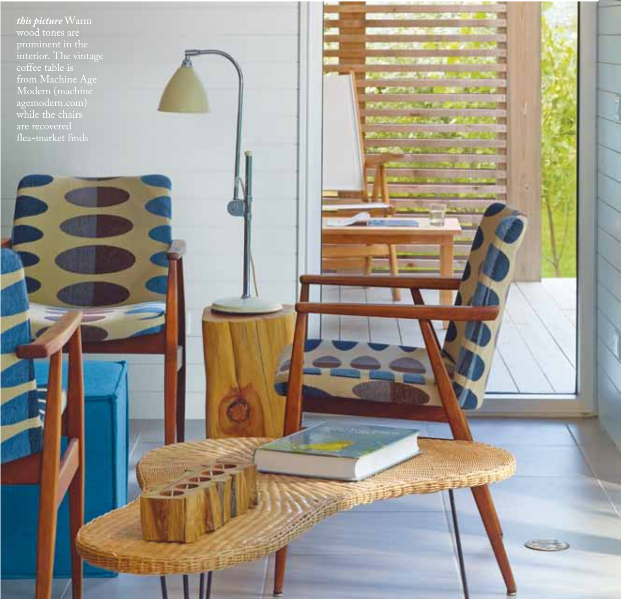
this picture Warm wood tones are prominent in the interior. The vintage coffee table is from Machine Age Modern (machineagemodern.com) while the chairs are recovered flea-market finds