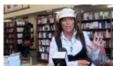
Tips for First-Time Home Buyers